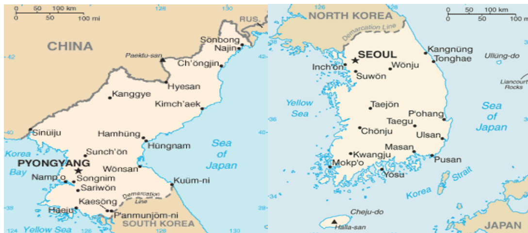
Figure 1-5: (Left) Current map of the Democratic People's Republic of Korea

In the South, Rhee Seung Man continued his leadership as the first president of South Korea. However, his political repression of his opponents, such as the massacre of Communist rebels, and his authoritarian governing style became controversial. Rhee Seung Man attempted to amend the constitution to be re-elected solely upon popular vote. Rhee managed to serve as the president for four consecutive terms, however, a revolution led him to resign, and he was exiled to the US. In the following years, South Korea underwent economic hardship and political struggles against a series of military regimes until the 1960s.