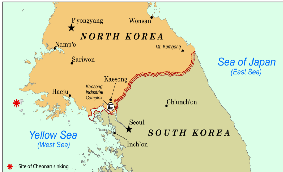
Figure 1-7: Kaesong Industrial Zone (Korea Trade Investment Promotion Agency)

The Kaesong Industrial Zone (KIZ) is in the city of Kaesong, the DPRK. The KIZ is located 43 miles north of the capital of the ROK, Seoul, and 106 miles southeast of the capital of the DPRK, Pyongyang. It is also only 3 miles away from the demilitarized zone (DMZ). The KIZ is a unique place in a sense that it is one location where people from the South and the North are allowed to interact on a daily basis. To be more specific, it is an industrial complex where the two Koreas agreed to build a joint economic territory with a combination of North's human labor and South's capital investment and business knowhow. As indicated in Table 2 below, the KIZ is growing quickly since its opening in 2004. The two nations also plan to make a significant expansion within a few years. This thesis finds that the KIZ serves as a unique element that can affect the DPRK reform.